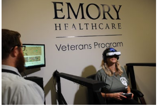
Virtual Reality Exposure therapy, an extension of Prolonged Exposure therapy, immerses the patient did. They got better," in a virtual world that is reminiscent of his or her traumatic memory.