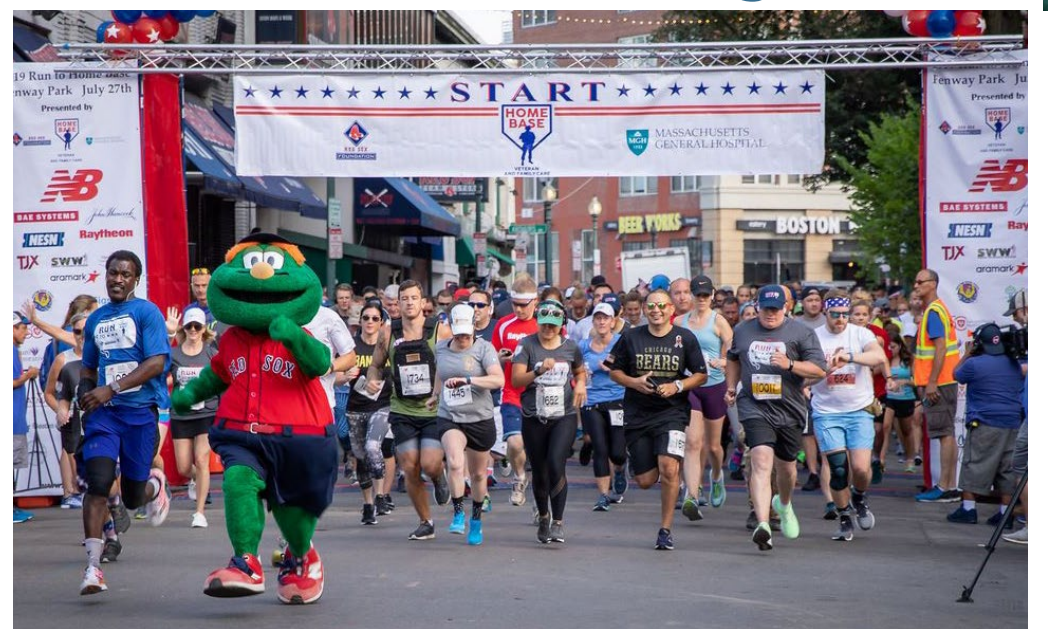
Run to Home Base 5K/9K start line.

This summer, Home Base, a Red Sox Foundation and Massachusetts General Hospital program, hosted its 10th annual Run to Home Base presented by New Balance 5K/9K fundraiser. This year marked